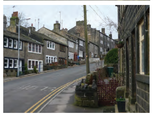
Top: Bronte Parsonage Museum, Haworth Middle: Oxenhope Railway Station Bottom: Oakworth

their individual characters and sense of place whilst meeting local needs for housing and amenities served by improved bus and rail links to Keighley town centre, Bradford city centre, Bingley, Queensbury and neighbouring Halifax.